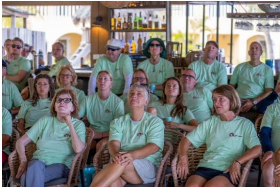
ReeFiesta divers and snorkelers listen to an educational presentation before getting in the water to practice coral restoration techniques.

Please contact caitie@reefrenwalbonaire.org to request high-resolution versions of all images.