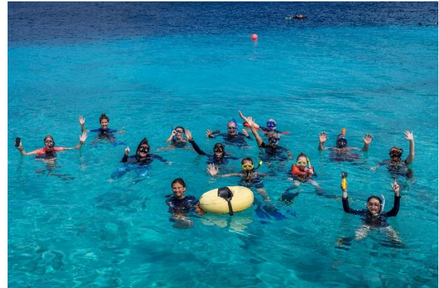
ReefFiesta snorkelers begin a tour of RRFB's nursery and restoration sites at Buddy's Reef.