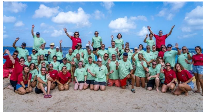
ReeFiesta divers and snorkelers pose for a group photo before getting into the water.