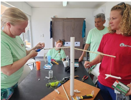
Dive shop instructors train ReeFiesta divers on proper nursery maintenance techniques before heading into the water.