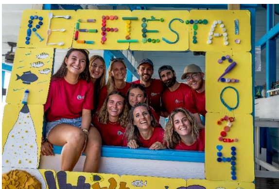
The RRFB team poses for a photo in the ReeFiesta photo frame.